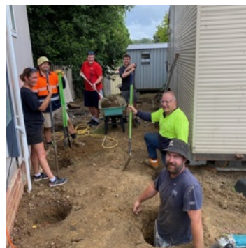
Some of the workers and the first completed steps